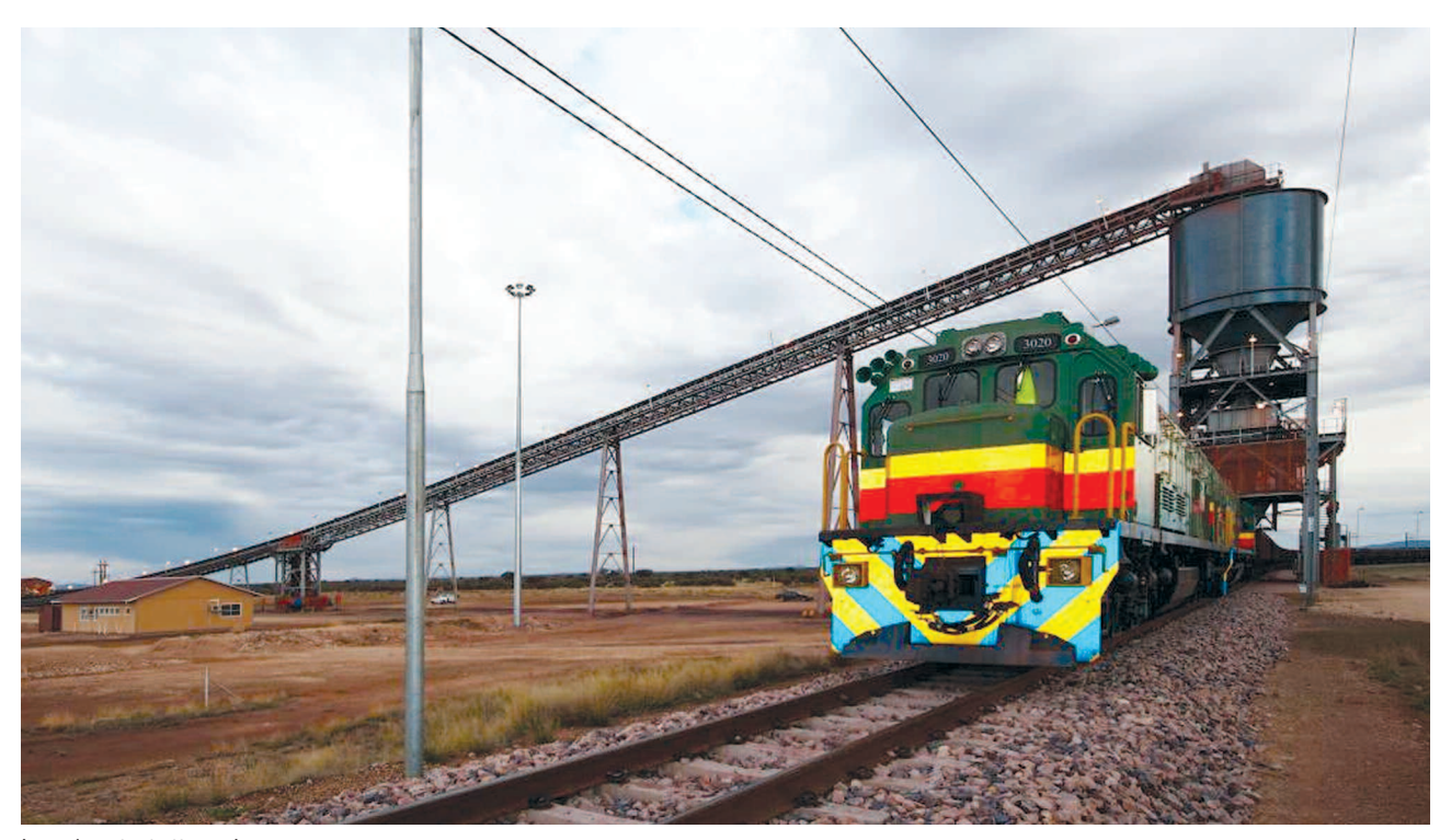
Load out station, Assmang

Safety | Reliability | Innovation | Sustainability