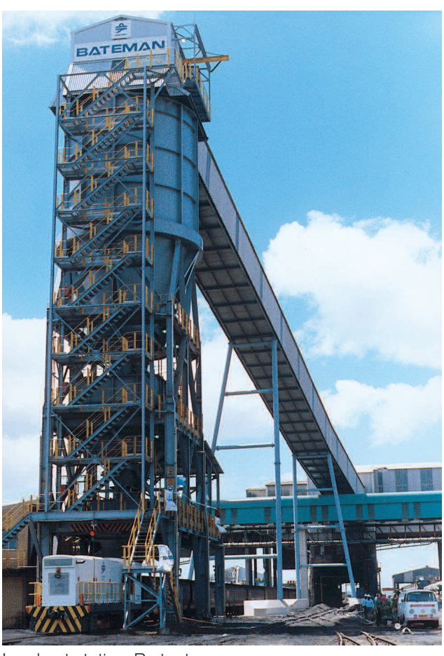
Load out station, Portnet

The Profile Chute is fail-safe in the event of any electrical or hydraulic power failure. The Chute will automatically move out of the way when obstacles enter the rapid rail loading system bay.