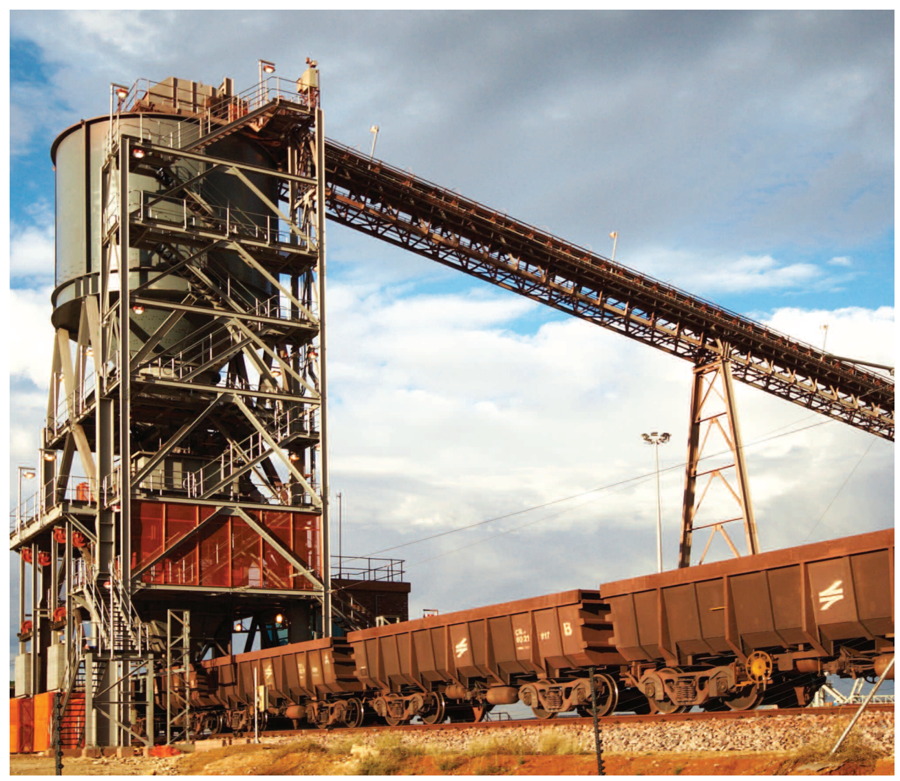
Load out station, Assmang