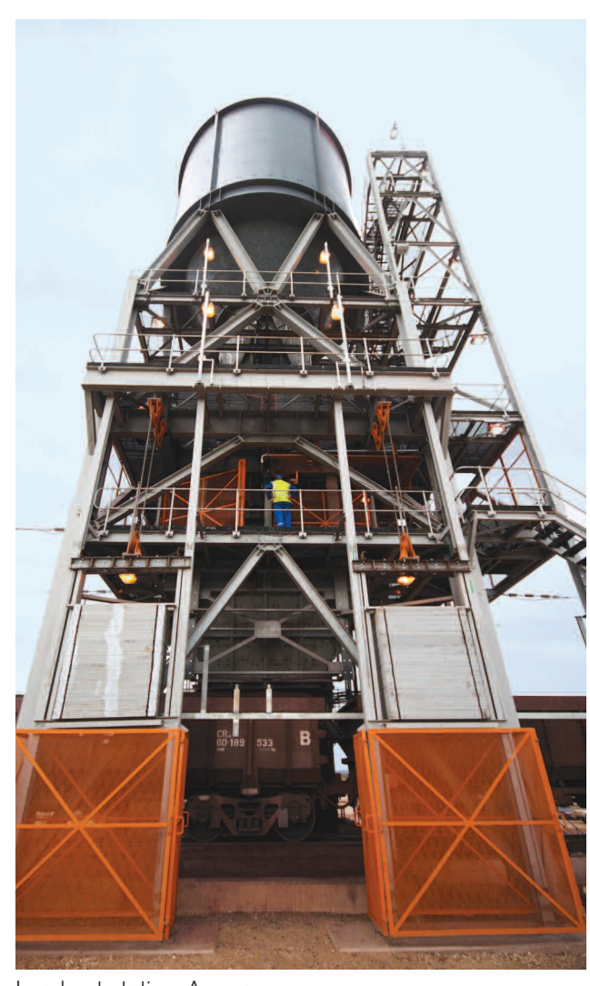
Load out station, Assmang