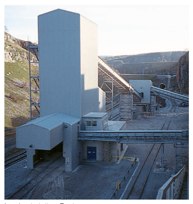
Load out station, Buxton